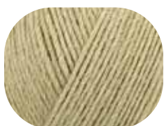
gras green 00070