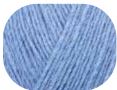
denim blue 00055